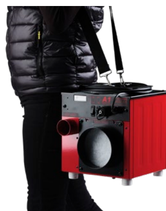
By hanging the dehumidifier from the shoulder strap, you can easily transport the machine between drying jobs.

One of our smart accessories for A1 is the shoulder strap for easy handling and transportation.